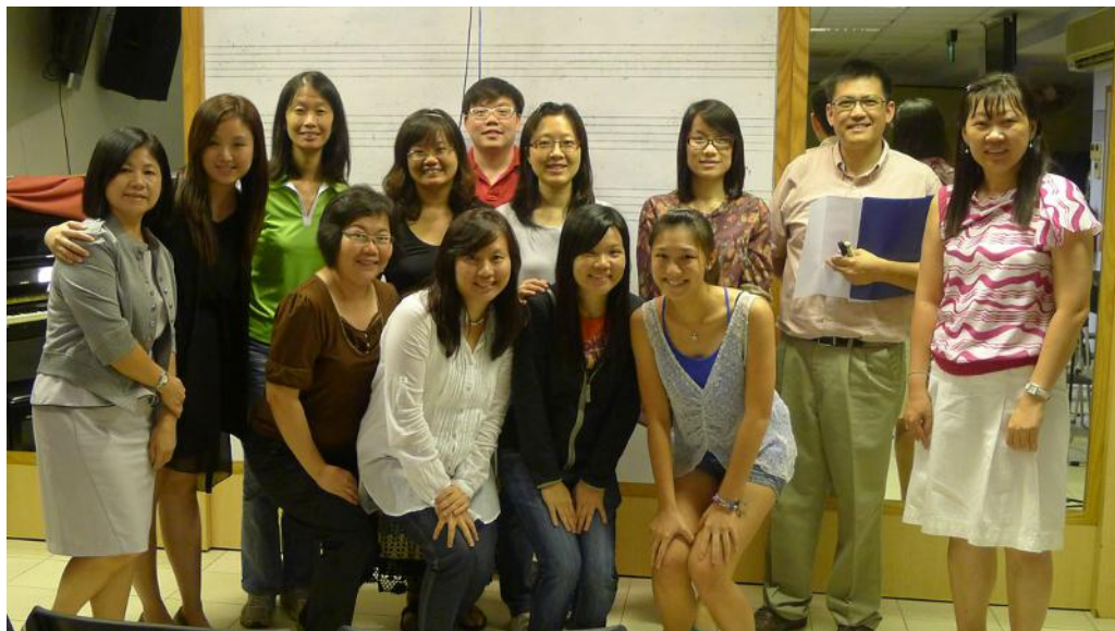
Hymn Arrangement Singapore 新加坡